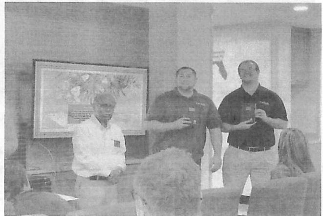
Pictures on a placement of Bibles in a local Hotel: The staff also received Testaments for themselves!

It is a pleasure to share with you briefly about the Ministry of the Gideons in our area. Church, we love you, pray to the Lord to bless you and make us all more of a blessing in our area.