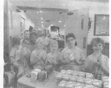
In a local church during VBS

We praise God for providing resources to reach record breaking levels two years in a row! We feel that we need to share a comprehensive financial report with our partners in the community.