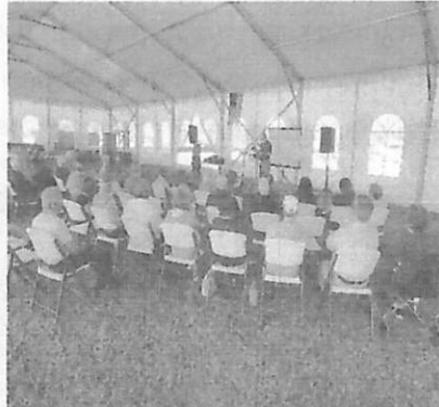
Pastor Appreciation Lunch 2024